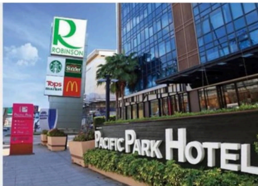
Pacific Park Hotel