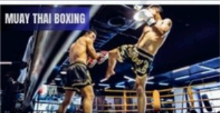
MUAY THAI BOXING