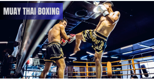
MUAY THAI BOXING