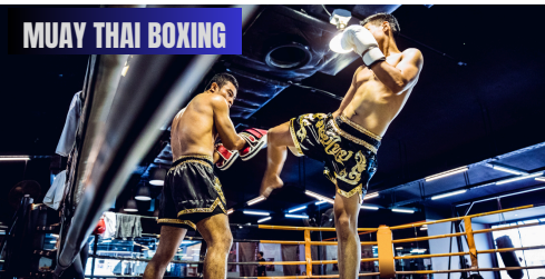
MUAY THAI BOXING