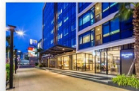
PARK PLACE BUILDING

PACIFIC PARK HOTEL , is a luxury hotel & serviced apartment, where these 3 buildings are next to each other, located in Sriracha District, Chonburi Province, Thailand, in the heart of business and shopping area, across the street is Pacific Park Shopping Centre, Robinson Department Store and Retail Stores, Surrounded with financial institutions, Schools, Hospitals etc.